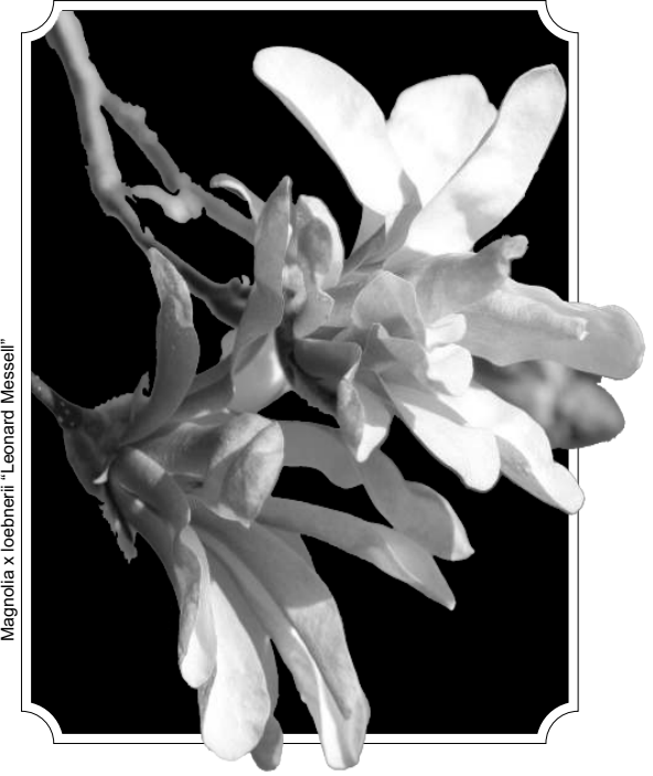
Magnolia x loebnerii "Leonard Messel"